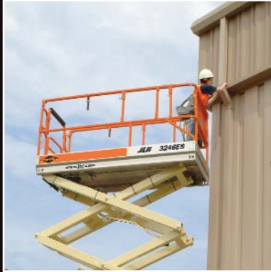
Longer Duty Cycles Keep You On the Job Longer