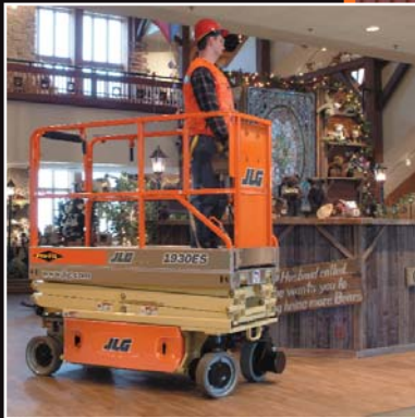
Quieter, Cleaner Operation for Indoor Work Areas