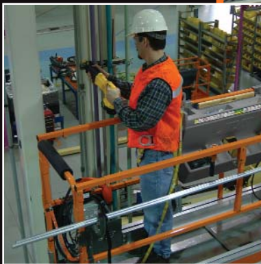
Application-Specific Tools to Do Your Best Work